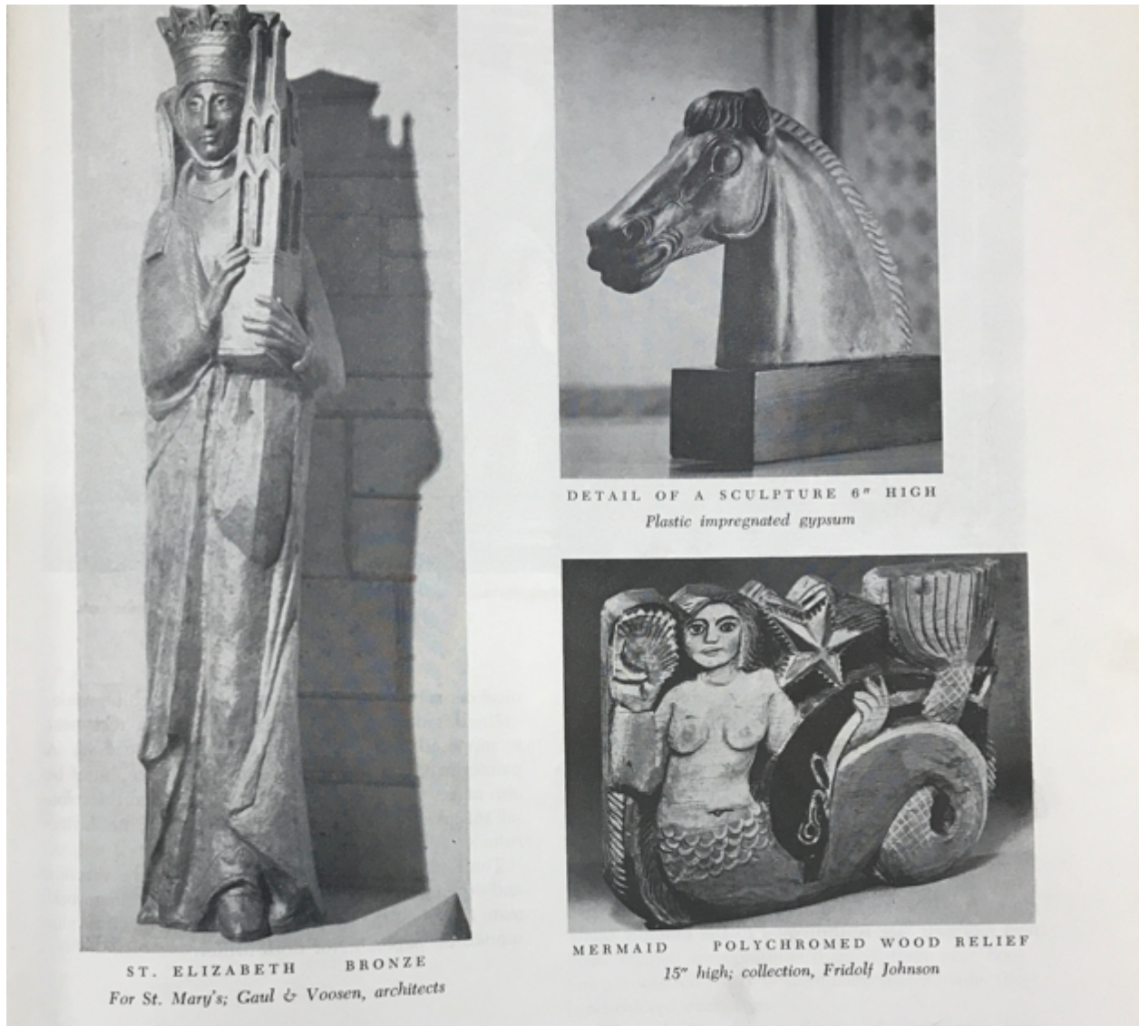
Fig. 2 Louise Bruner, "Edgar Miller: A Versatile Artist and Craftsman," American Artist (May 1963): 42-43.