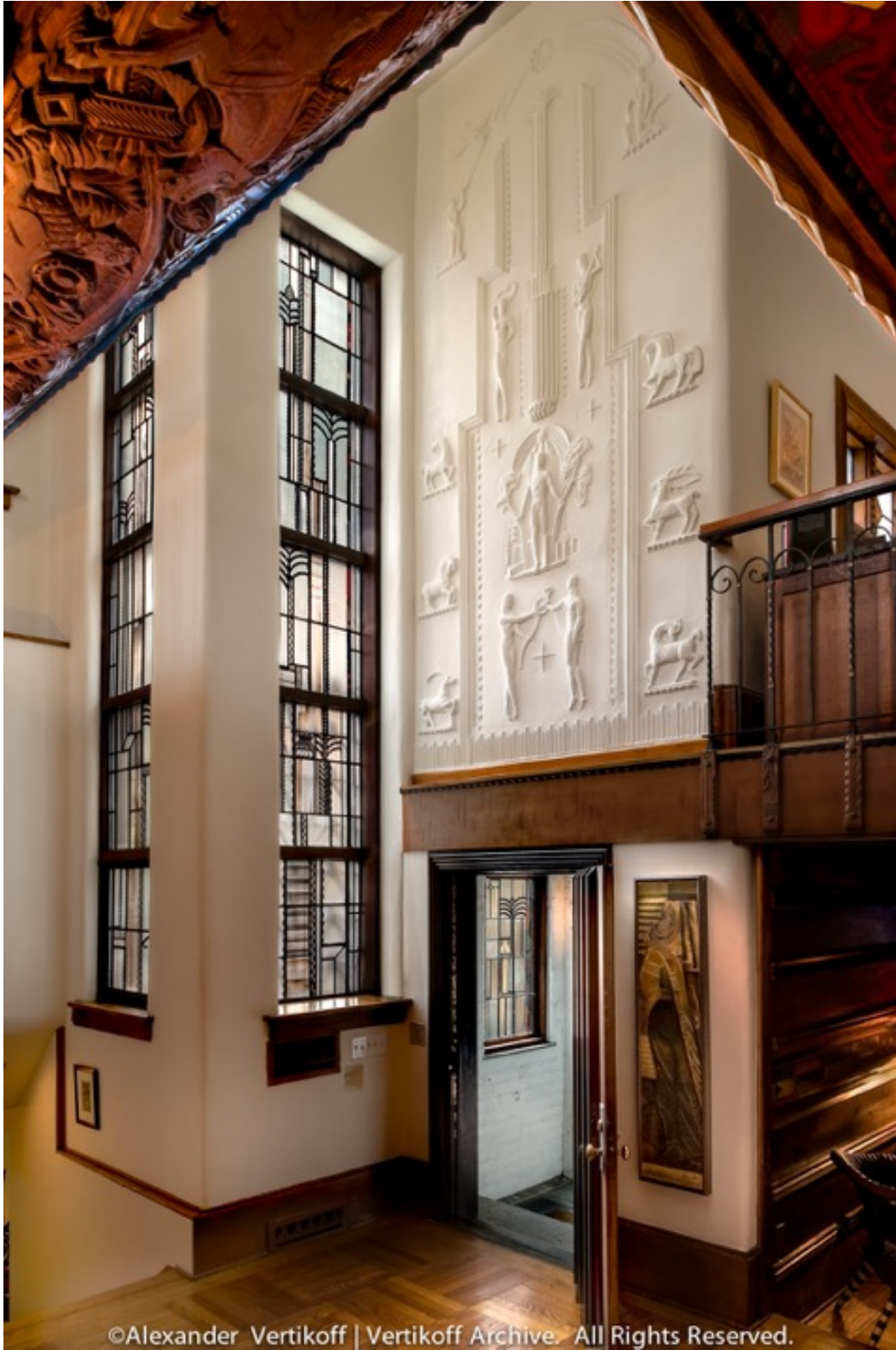
Fig. 7 Foyer, R.W. Glasner Studio.