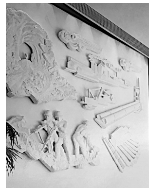
Fig. 14 & Fig. 15 Edgar Miller, sculptures for the lobby of the U.S. Gypsum Building, 1963, gypsum, whereabouts unknown.