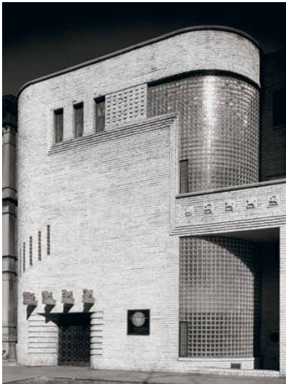
Fig. 10 A.N. Rebori, Frank F. Fisher Apartments (entrance), 1936, with wood carvings and terracotta reliefs by Edgar Miller, 1209 North State, Chicago, IL.

The State Street facade of the Fisher Apartments displayed two distinct sculptural groups: a set of five low-relief terracotta inserts depicting Miller’s characteristic animals, and four pieces of oak stylistically carved to resemble a horse, buffalo, mountain lion, and whale, visible from both the south and north and extending out from the building above the entrance Fig. 10 . These elements complemented the building, but also provided points of visual pause and material contrast. Rebori and Miller wrote, “In terms of humanistic logic, they mark the entrance with statements of life and vitality which can be enjoyed more than a purely mechanical marker ever could be enjoyed.” 18 In short, Miller’s sculptural additions provided distinct, lively texture.