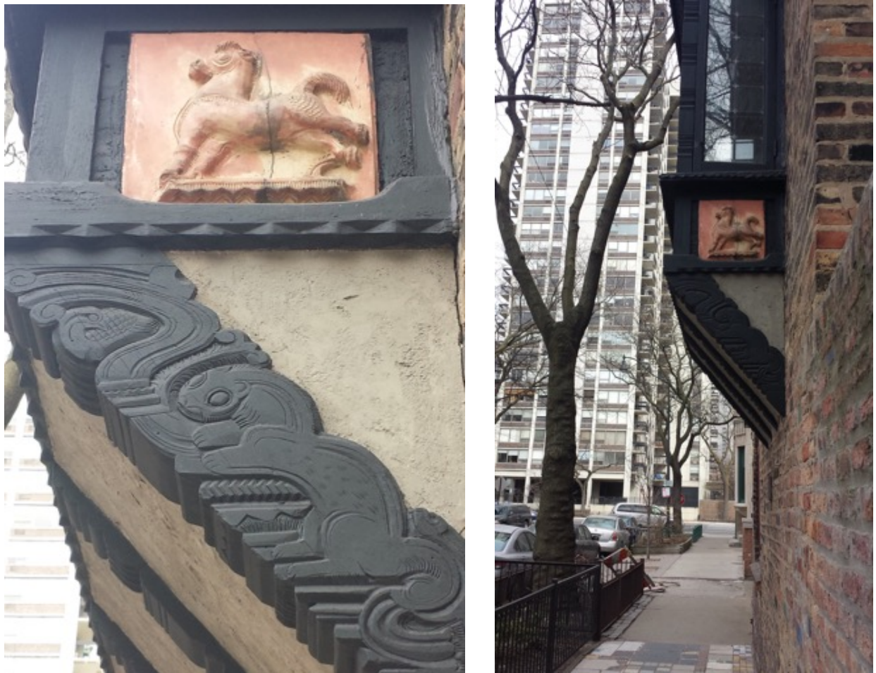
Fig. 6 Edgar Miller, sculptural details, exterior of Carl Street Studios at 155 W Burton Pl.

The result was architecture bursting with sculpted materials and objects, enlivened textures emerging from every surface, nook, and cranny. From the terra cotta reliefs of animals lining the base of a bay window extending out over the street at Burton Place Fig. 6 to the grand, yet subtle plaster bas relief (low relief) on the interior wall above the front door of the R.W. Glasner Studio at the back of the Wells Street complex, every room and what seems like nearly every surface erupts with texture, with transformed matter and three-dimensional elements extending out into space. The bas relief Fig. 7 , in particular, exemplifies Miller's approach to sculpture.